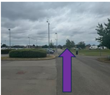
Field between Abbeyfield and Abbey Primary.