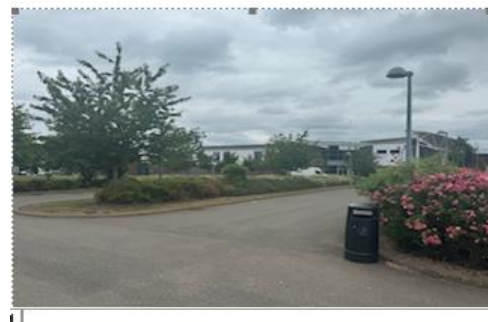
If entering site from a45, walk past the front of Abbeyfield school to continue onto the field.